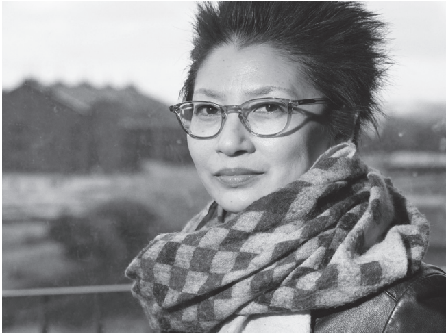
Akemi Takeya © Naoto Lina